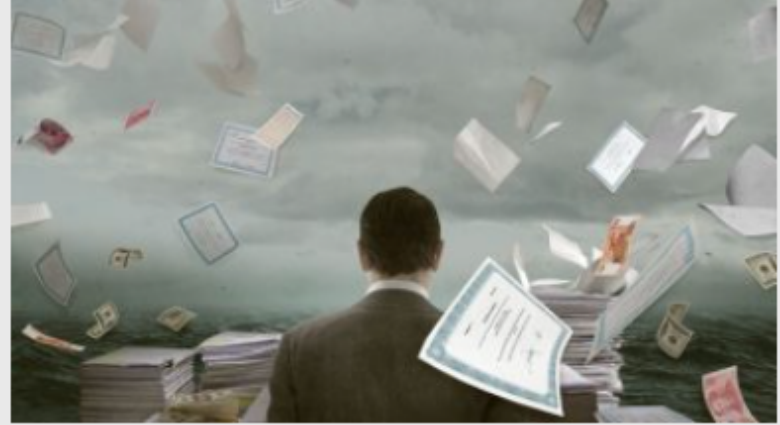
The Panama Papers: Exposing the Rogue Offshore Finance Industry